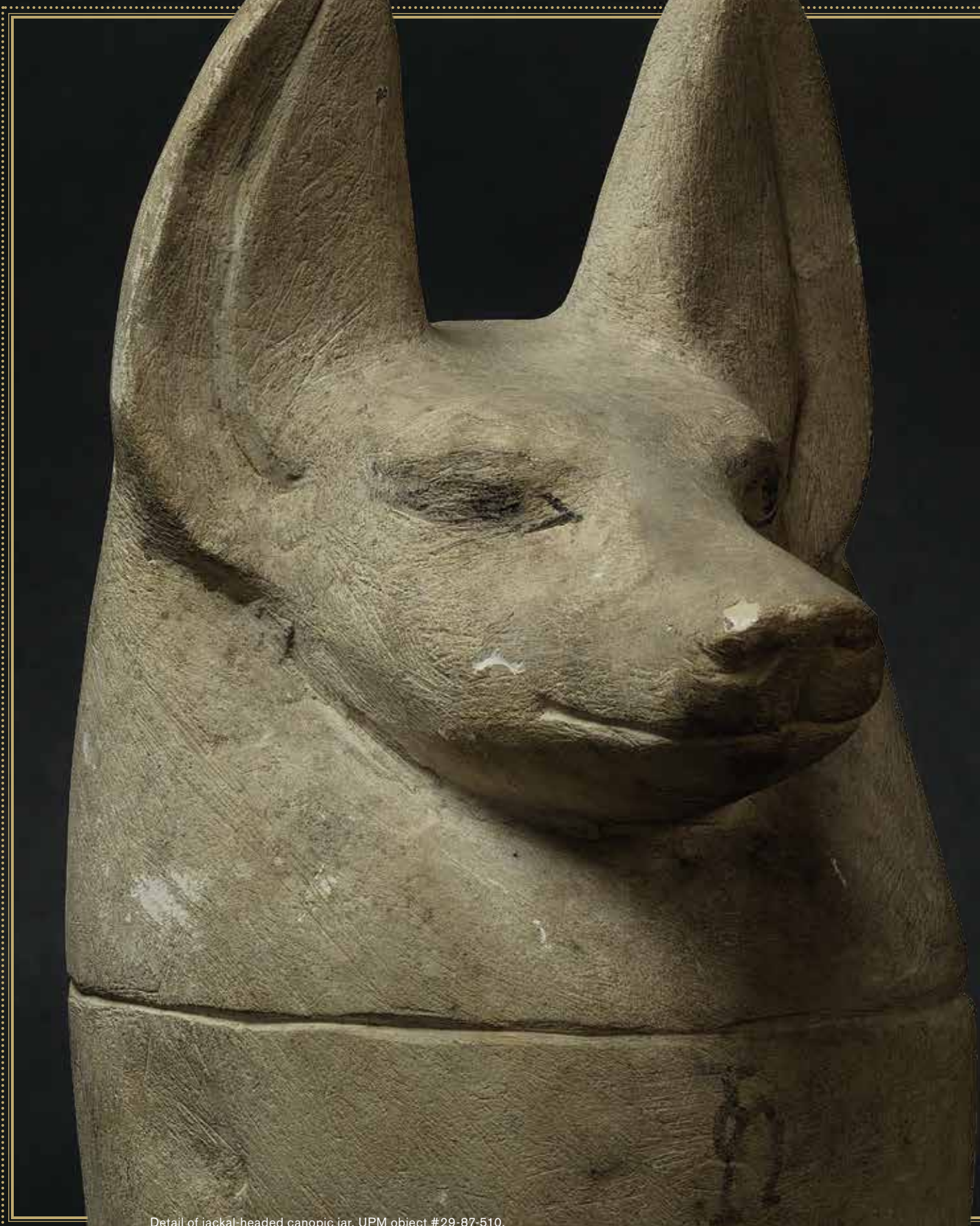
Detail of jackal-headed canopic jar. UPM object #29-87-510.