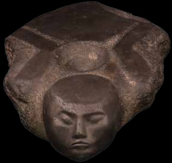
ABOVE: Door socket. By depicting the enemies of Egypt at the base of the threshold where they would be repeatedly trampled, this door socket would have magically ensured their continued submission to Egypt. W. 21", UPM object #E3959.