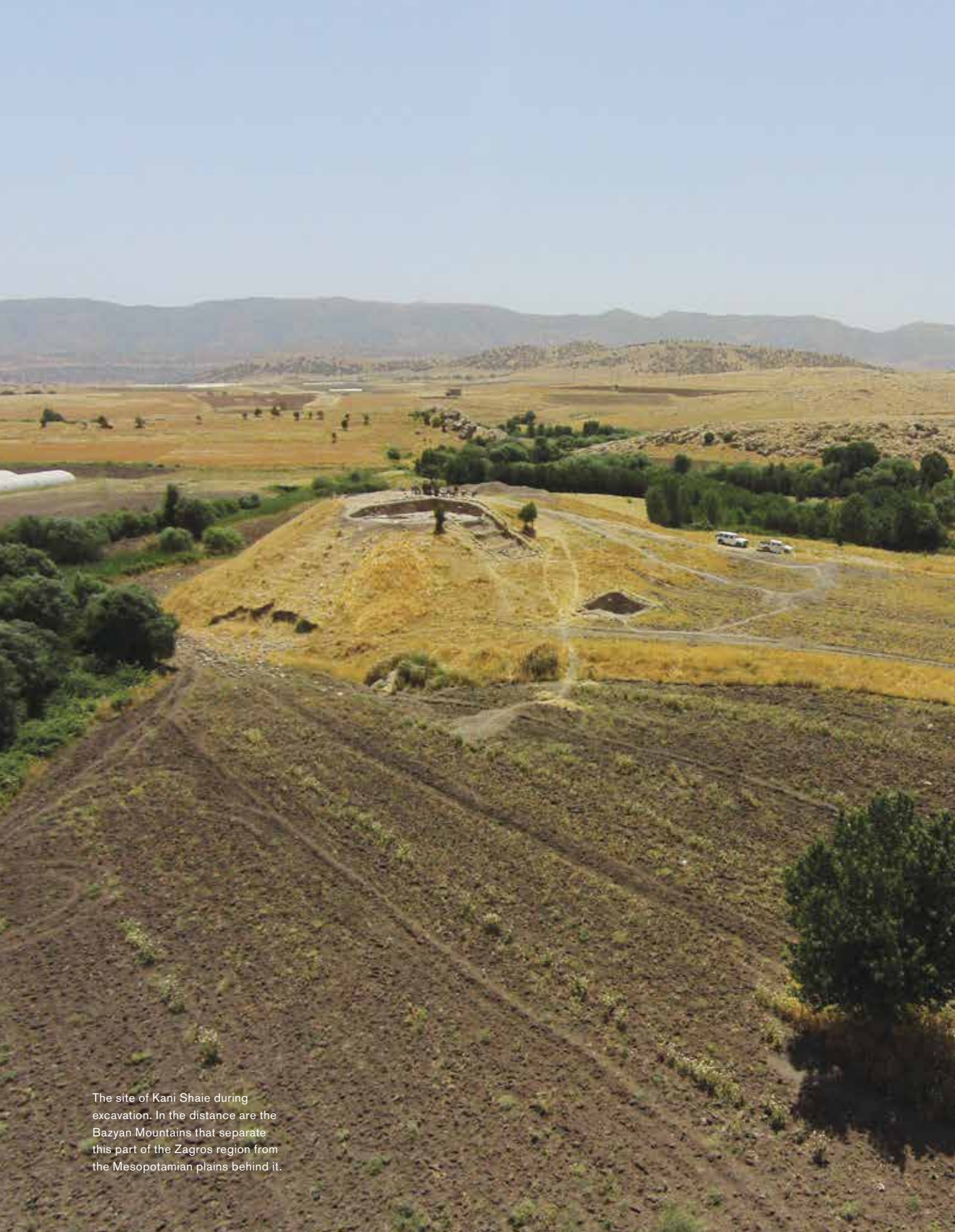
The site of Kani Shaie during excavation. In the distance are the Bazyan Mountains that separate this part of the Zagros region from the Mesopotamian plains behind it.