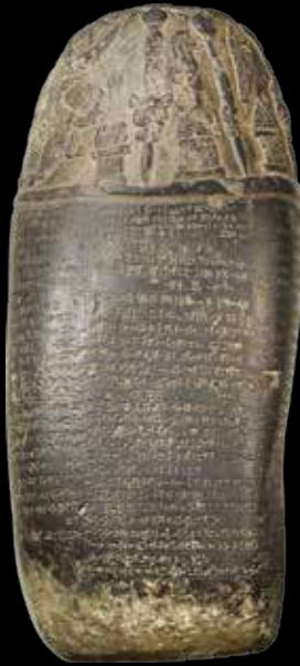
ABOVE: Boundary stone from Nippur, Iraq. From the Nebuchadnezzar I period (1146–1123 BCE), this stone contains a drawing of the field that was marked, along with curses that forbid anyone from interfering with the land owner, appropriating the land, or removing the boundary stone. H. 18.8", UPM object #29-20-1.