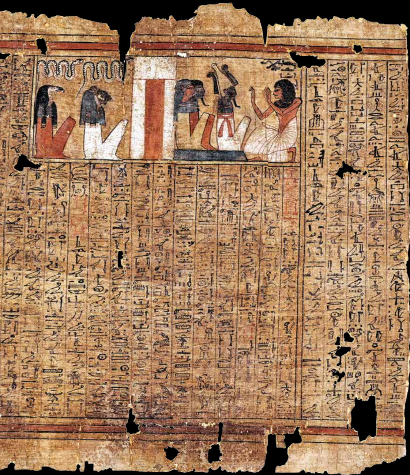
H. 13.8", UPM object #E2775E.