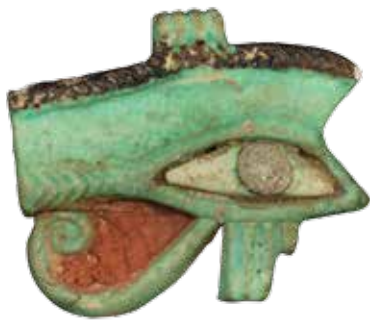
ABOVE: Wedjat eye amulet. The wedjat, or Eye of Horus, was a popular amulet worn for health and protection. It encompassed ratios that dictated drug measurement and from its form we derive our modern symbol for prescription, "Rx." W. 1.7", UPM object #E5078.

Magic was often employed for healing diseases and other internal injuries whose causes were not understood. One way of harnessing the power of the Egyptian healing god Horus was with a Horus Cippus, a small stone slab that could imbue water with healing powers. Even in the case of external wounds treated with poultices and bandages, a physician-priest might recite a spell over the bandage to promote healing. Similarly, he might use the fractions or proportions contained in the wedjat (eye of Horus), a magical symbol for healing, to determine what quantities of herbs should be used in a poultice.