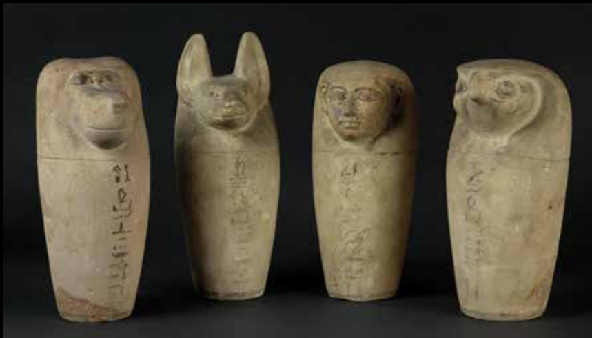
LEFT AND BELOW: Canopic Jars for the preservation of organs during mummification. Each of the four sons of Horus was associated with a specific organ: Hapy (baboon-headed) with the lungs; Duamutef (jackal-headed) with the stomach; Imsety (human-headed) with the liver; Qebehsenuef (falcon-headed) with the intestines. H. approx. 10.8", UPM object #29-87-(509-512).

These so-called execration texts were clay figurines or bowls inscribed with the names of threatening persons, then broken into pieces and buried. The destruction of the names of one's enemies resulted in the destruction of the threat they posed. This is an example of "sympathetic magic," a term that refers to a wide variety of magical practices, offensive and defensive, that imitate the effect one wishes to produce. Other forms of sympathetic magic found in Egypt include the representation of enemies on sandals and door sockets. The repeated action of stepping on one's enemy or hitting an enemy with a door was efficacious in ensuring his defeat and subjugation. By means of such curses and sympathetic magic, individuals gained a degree of control over their enemies and their future.