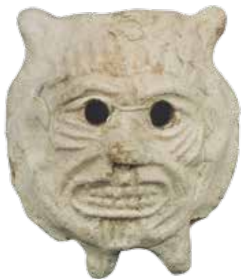
LEFT: Protective figurine of Humbaba or Pazuzu. The striations around the face of this demon are either the entrails of an enemy, worn by Humbaba, or the whiskers of Pazuzu’s lion-like face. Both demons were among a number of apotropaic images that warded off evil. H. 3.9”, UPM object #33-35-252.

Ancient practitioners employed both helpful, defensive magic and harmful, offensive magic, which might be thought of in modern terms as “white” or “black” magic. The former includes apotropaic , or protective, magic. Apotropaic magic was predicated upon a belief that certain depictions, texts, or practices shielded the user from harm. For example, thousands of phallic-shaped amulets, which warded off evil and misfortune for the wearer, survive from antiquity.