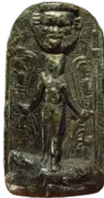
ABOVE: Horus Cippus. Decorated with the image of the Egyptian healing god Horus and inscribed with healing spells, this stone instilled curative powers in water that was poured over it. H. 4.5", UPM object #E15270.

magically healed. To ensure the continuation of their good health, patients cured by Asklepios dedicated votive statues of their healed body parts in his temples, the most famous of which was in Epidauros on the Greek Peloponnese. These votives were often produced en masse and, subsequently, each was inscribed with the name of the person dedicating it, before being given to the temple.