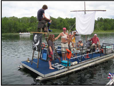
2010 Boat Parade contestant