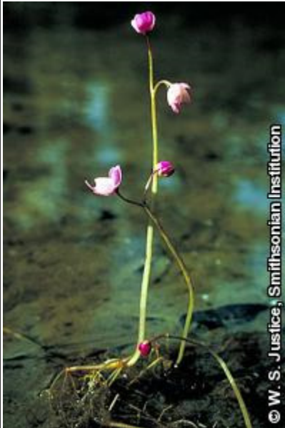
© W. S. Justice, Smithsonian Institution

I recently attended a seminar on Groundwater in the Pine River Watershed which covered a variety of topics. We reviewed maps of the area which indicated that, due to the geological nature of the immediate area around Hand and Hay Lake, it is very susceptible to water pollutants. The sandy soil rapidly delivers rain, which can pick up pollutants, to the ground water and aquifers. This can impact local wells and, of course, our lake. Trees, bushes and other ground cover help to strain the water and remove pollutants like nitrogen and glyphosate from fertilizers and herbicides; but, not using those things near the lake is a far better way to keep our lakes and wells healthy. It is recommended that wells be tested annually to assure your water is safe. On average, 25% of tested wells are found to be unsafe. The lake should be tested, as well.