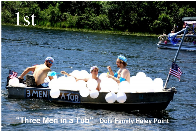
"Three Men in a Tub" Dols Family Haley Point