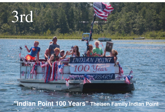
"Indian Point 100 Years" Theisen Family Indian Point