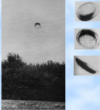
The first photo taken by the witness and the object appearing in the others