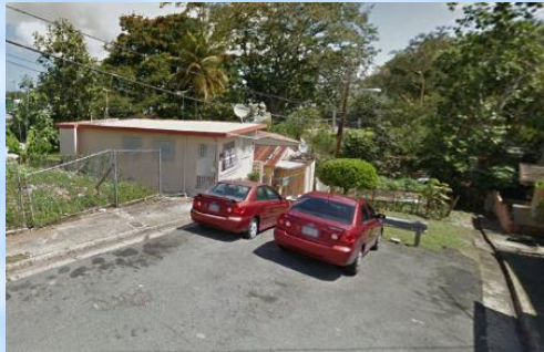
The site of the incident at Buen Consejo Rd

Four witnesses were awakened by noises in their patio where they kept some caged rabbits. Looking out they were stunned to see five strange looking beings inspecting the cages. Two of the beings were five-foot tall and the other 3 were three-foot tall and heavier. The tall thinner ones wore a one-piece brown outfit, had grayish skins with large ears, large eyes and a large