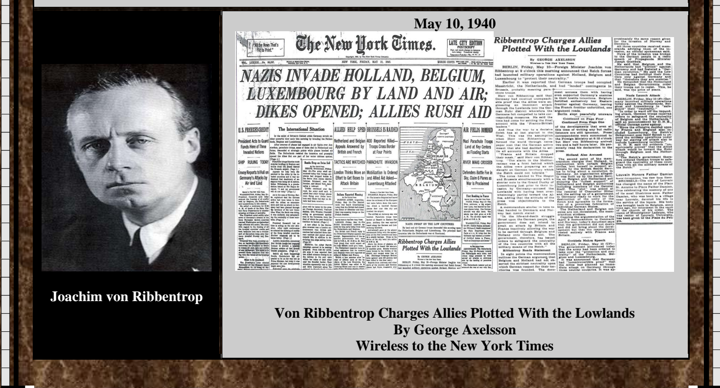
But a de-emphasized article from that same Times' issue did present a different version of events -- an 'inconvenient' version that has long since 'disappeared' from history.