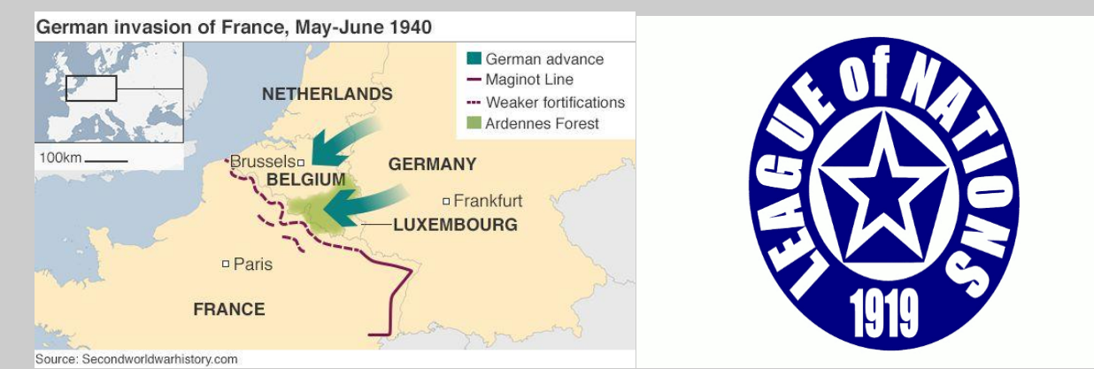
Britain, France, Holland and Belgium were all members of the Globalist League of Nations. Germany took the fight to them in self-defense.

The tiny states of Belgium and The Netherlands / Holland ( both members of the Globalist League of Nations ) claim to be "neutral." In reality, under the pressure and influence of mighty England & France ( also members of the League of Nations ) the two mini-states have been assisting the Allies in their preparation for an attack upon Germany - which had quit the League of Nations in 1933. On May 10, 1940, Hitler orders the invasion of the Low Countries.