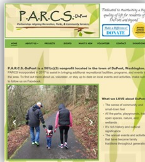
Coming in November, we will be launching our website!