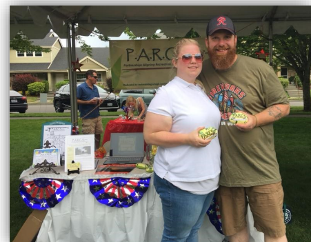
P.A.R.C.S.-DuPont hosts numerous community events including rock hunting, rock painting and all-ages kickball.