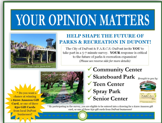
P.A.R.C.S.-DuPont collaborates with the City of DuPont to design and facilitate a citywide survey of residents and conducts a stakeholder focus group.