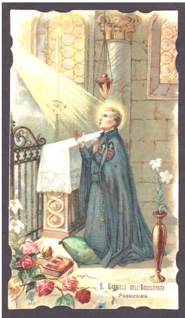
St. Gabriel of Our Lady of Sorrows