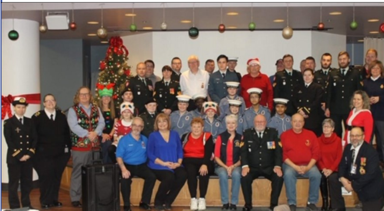
In photo - Zone A6 Legion, District A Legion, 31 Canadian Brigade Group, HMCS Prevost, NLCC Glorious, Navy League Cadets, #9 RCACC & Army Corp Cadets