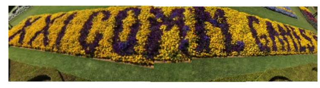
Laurel Bank Park featured a floral depiction

of the 2018 Commonwealth Games. Apart from the title, pictured above, they showed the Gold, Silver and Bronze medals, along with a floral podium for the presentation to the winners.