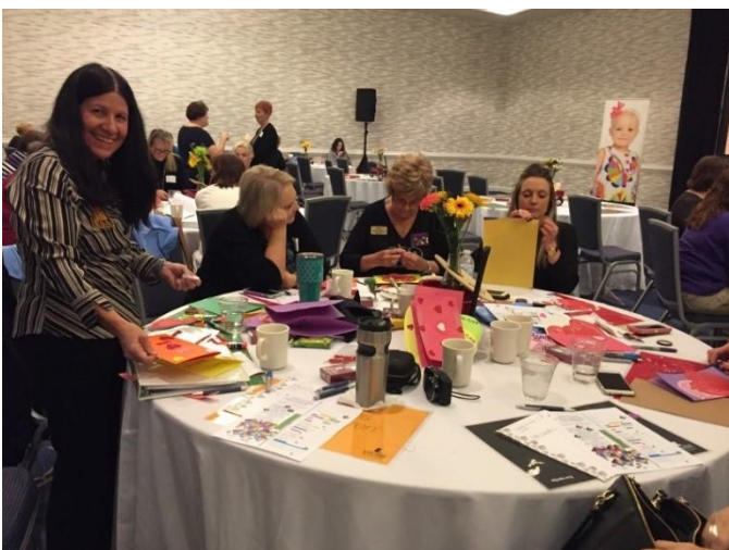
Rho Chi of Florida was the host chapter for Thank You ESA Day.