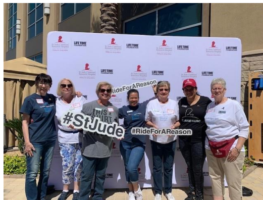
Eta Gamma Members at the Las Vegas St. Jude Ride for a Reason event

Get supplies to keep in your pockets and take to your events, including the red "ESA Volunteer" aprons, back by popular demand. Visit www.epsilonsigmaalpha.org/membershiphost for details.