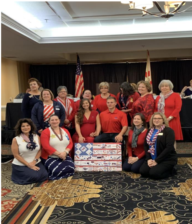
Folds of Honor Presentation