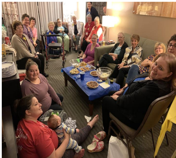
NC State & Guests in Hospitality Suite