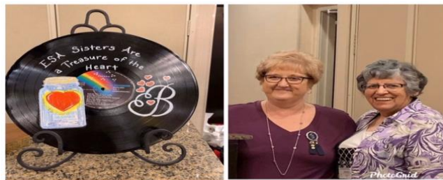
State President's Gift

I pray that ESA will have this same reaction around the world that it only takes one member to invite one person to a chapter meeting, social or a special event in their area. We need to grow ESA this year and let everyone in on this great organization and what we can do to help our communities around the world.