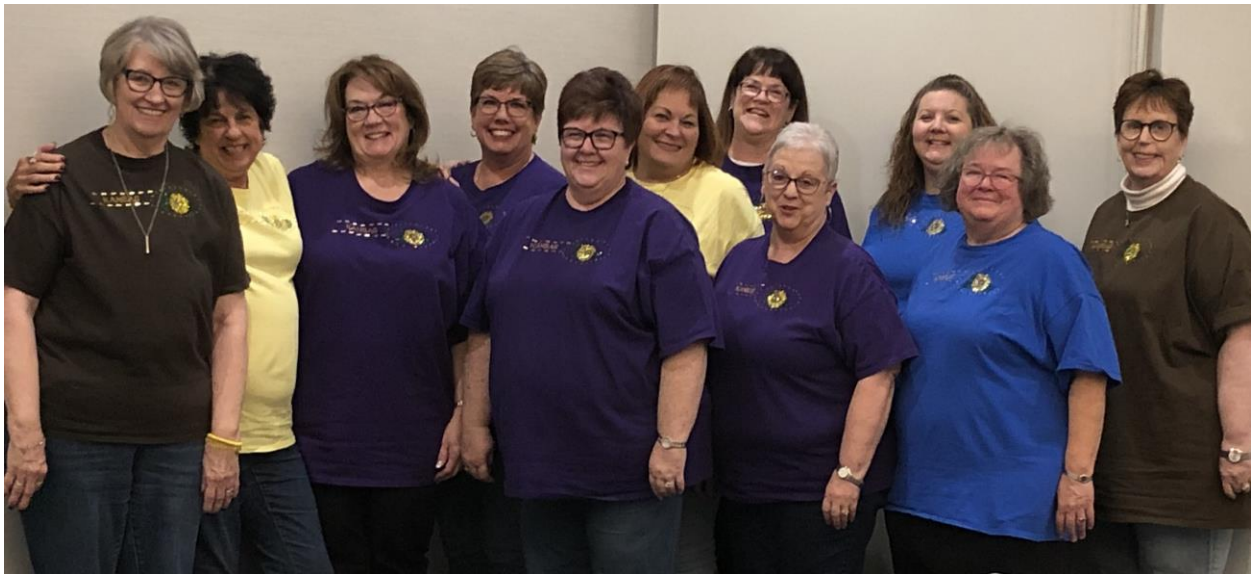
Kansas State Council Executive Board