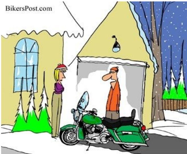
"When you said you were going to buy something that would get rid of your winter blues, I thought you meant something like a summer outfit, not a motorcycle."