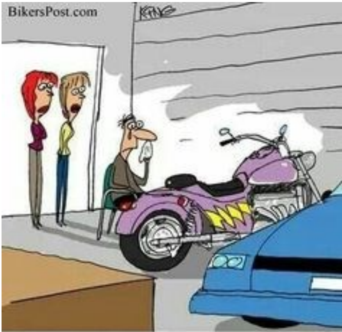
"He has sat there all winter long crying and looking at his bike. Warm weather couldn't come soon enough."