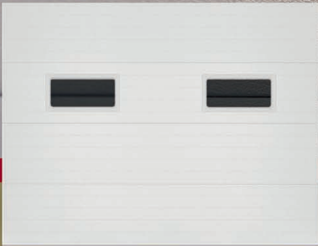
9' x 7' 3236 white with optional 24" x 12" windows and tinted glass