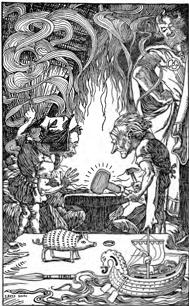
THE THIRD GIFT — AN ENORMOUS HAMMER