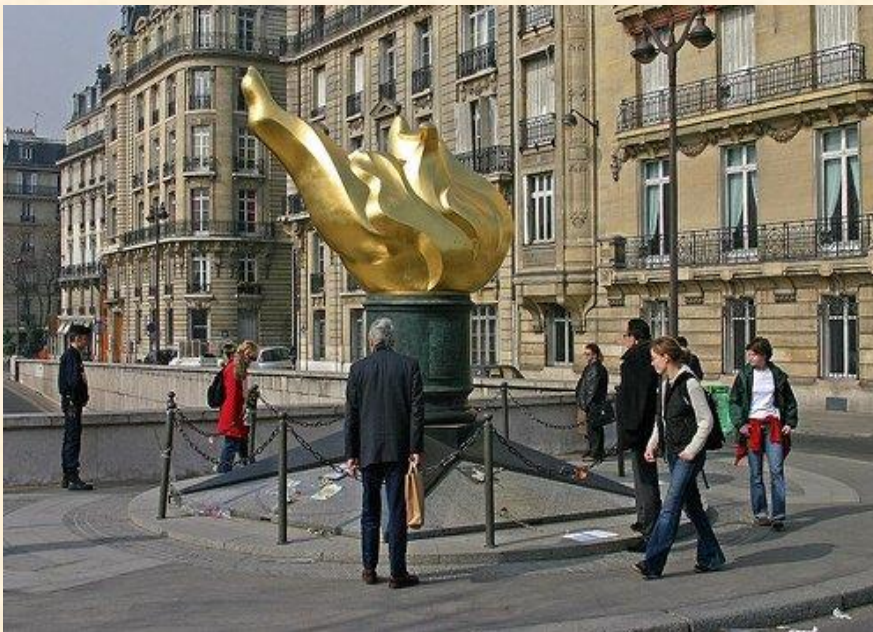
The Memorial Torch of Pont d’Alma