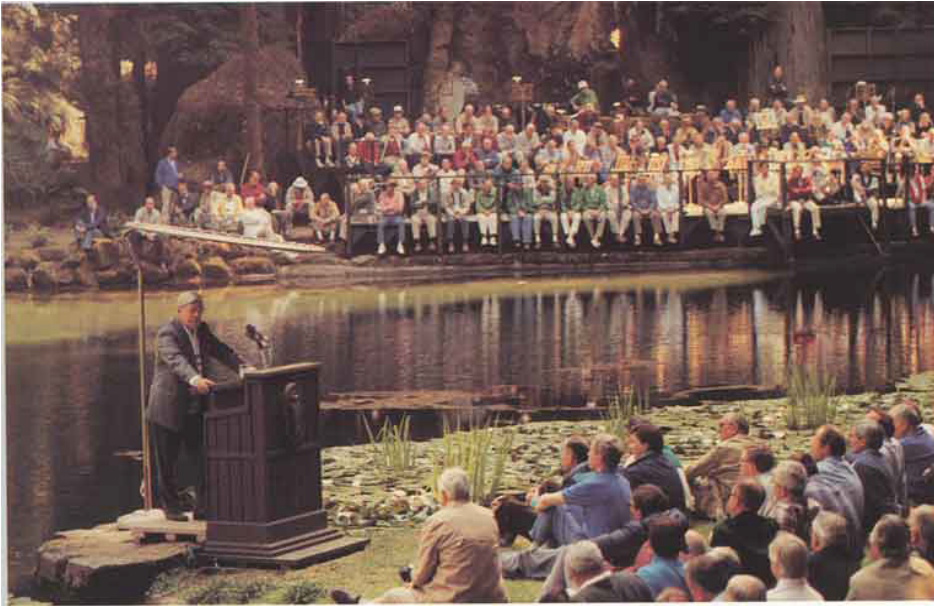
Lakeside 1991: Helmut Schmidt