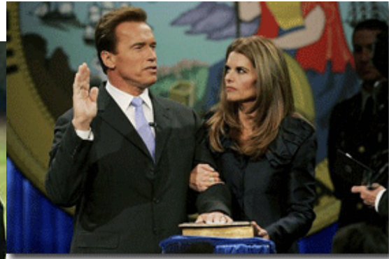
Arnold Schwarzenegger puts his hand on the bible while being sworn into office as the governor of California. His wife, Maria Shriver stands on his left.

Proof is all around assigns him with being a foot soldier of the Elite. Again, in a July 2003 San Francisco Chronicle article reported that the Bohemian Grove gave the word to allow Schwarzenegger to run to be the state governor of California: