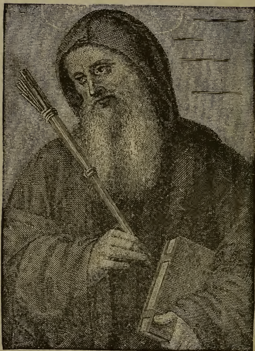
SAINT BENEDICT, ABBOT.