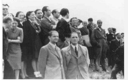
Succumbing to pressure following the to <u>Theresienstadt</u>, the Germans permitted

ghetto taken during an inspection by the International Red Cross. Prior to this visit, the ghetto was "<u>beautified</u>" in order to deceive the visitors. Czechoslovakia, June 23, 1944. ......according to the Ho