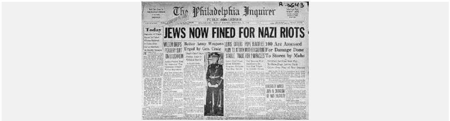
Philadelphia Inquirer, 1938. Jews were indeed fined for the destruction of Kristallnacht because they were responsible for the incident. The moment Goebels heard of the event, he ordered them stopped by the police as he knew it was a Zionist false flag terror event designed to scare the Jews of Germany.

“That is a contradiction in terms,” he said, “for true Communism is internationalist and all-inclusive. It cannot be nationalist and therefore exclusive. That is why I call the Territorial Zionists who founded the state of Israel ‘Zionazis’ and that is why people like Ben Gurion, Levi Skolnick, alias Eshkol and Golda Meyersohn, alias Meir, got along so well with the German Nazis, especially after their little Kristallnacht show which they deemed necessary to scare their fellow Jews out of Germany, hopefully to settle in Palestine.”