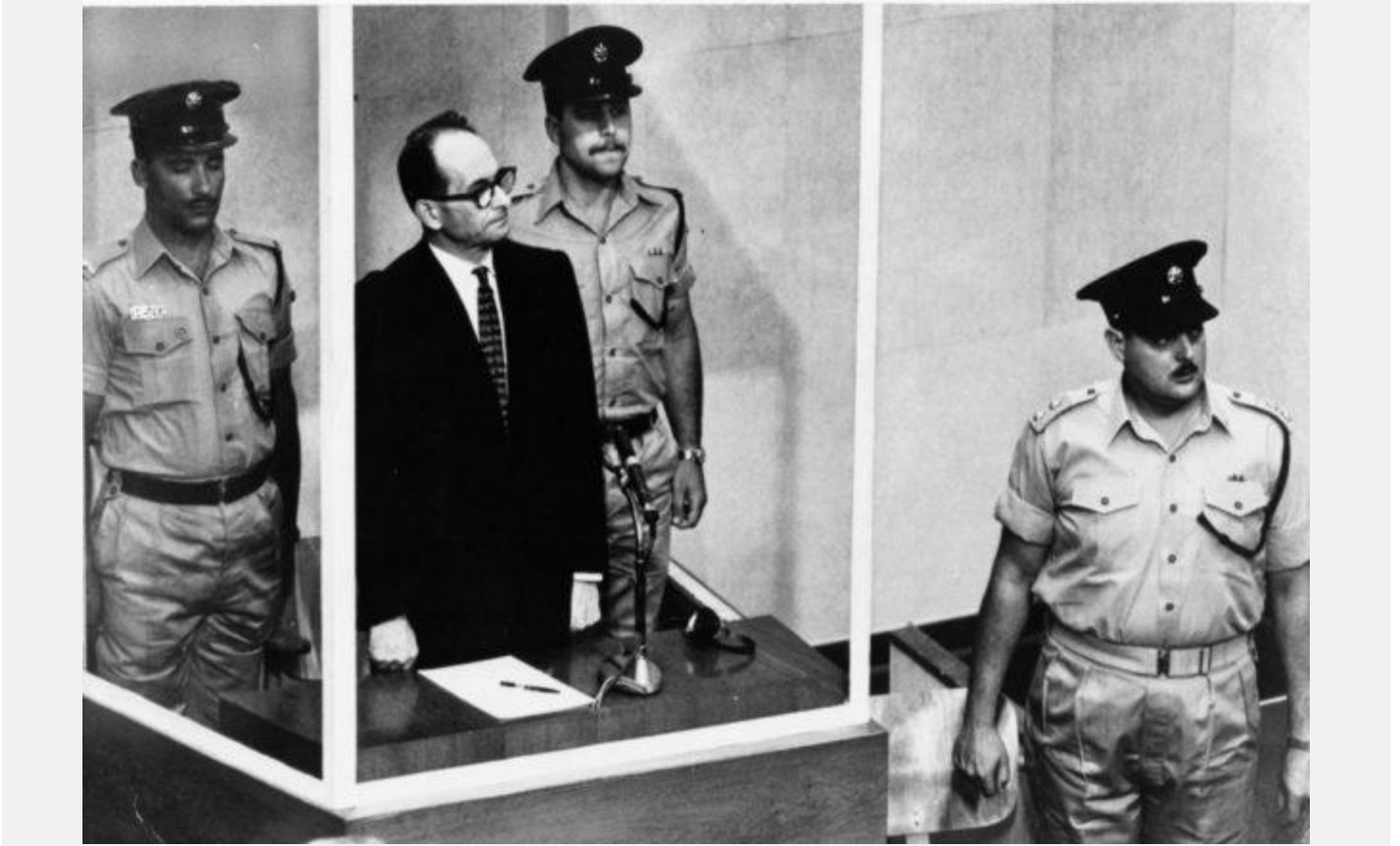
This 1961 file photo shows Adolf Eichmann standing in his glass cage in the Jerusalem courtroom.

“So what was Eichmann’s role in German Nazi-Zionazi collaboration?” I asked.