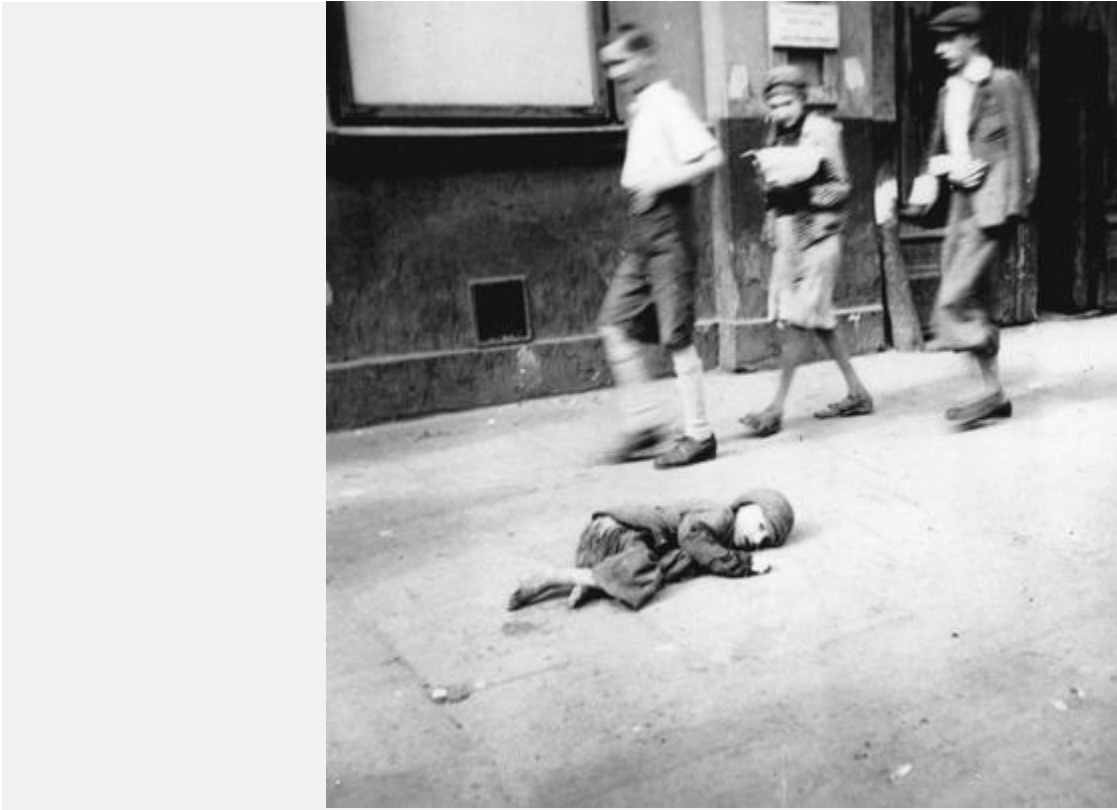
A starving child dying in the streets of the Warsaw Ghetto September 19, 1941

“What about the autonomous areas, where there was open land?” I asked.