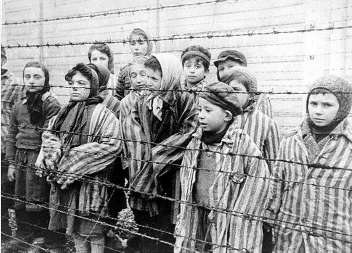
Children in Auschwitz, 1945