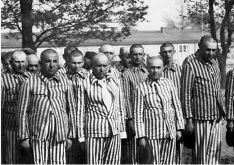
Fat Jewish workers in Auschwitz

"Was jewish suffering due to German policies?" I asked.