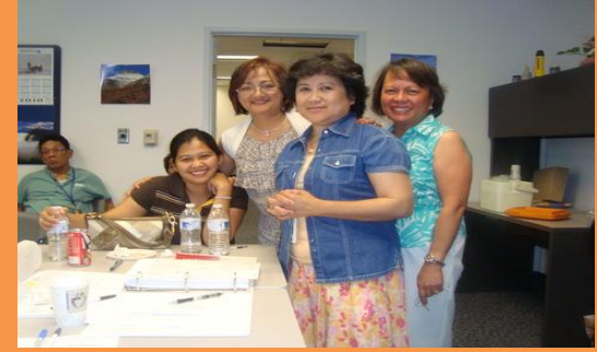
Photos taken during the 1<sup>st</sup> ever Executive Meeting @ San Diego Health Services