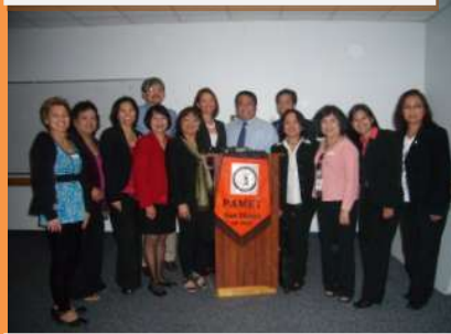
PAMET-San Diego Officers during the symposium last March 12, 2011