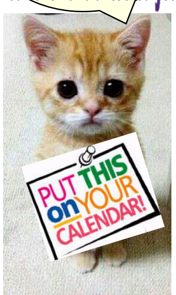
You've got to be kitten me!