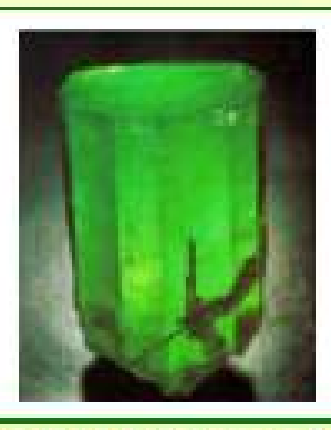
The 1,759-carat (12.4 oz.) "Guinness Emerald Crystal" was at one time the largest natural emerald crystal in the world, and is still preserved in its natural crystalline state, at the Banco Nacionale de la Republica in BogotÃi.