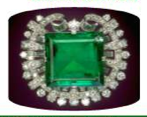
The 75.47-Carat Hooker Emerald was worn by Ottoman Sultan Abdul Hamid II, the last sultan of the Ottoman Empire.