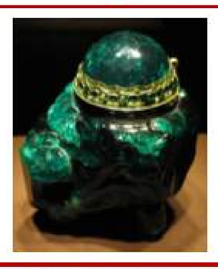
2,860-carat (20.18 oz.) emerald vase carved in 1641, is on display in the Imperial Treasury, Vienna, Austria.

There are many large emeralds that are valuable and famous. For a complete list visit www.gemsociety.org.