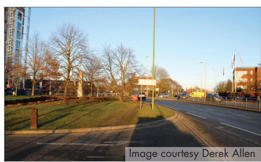
Black and white print taken in 1948 showing the static water tank used to store thousands of gallons of water during the war in case the water mains got bombed the road on the left leads to Shenley, the road on the right is the Elstree way. The colour photo shows the view today.