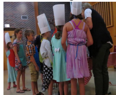
Children’s Sermon August 13, 2017

Learning each ingredient is important in cooking, just as each one of us are important to God and in our Church.