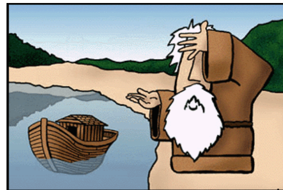
(See Genesis 6-8) 10-06-199

Reminder St. Mary Lake City Religious Ed classes will start Wednesday, September 18. Pre-K through 5th is from 4-5pm and 6th-12 start meal at 6:15pm with class from 7-8pm.