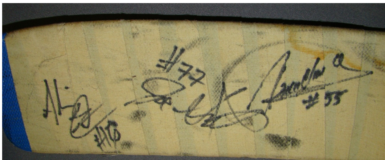
Alain Cote #16