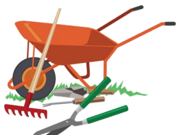
Cemetery Clean-Up Night