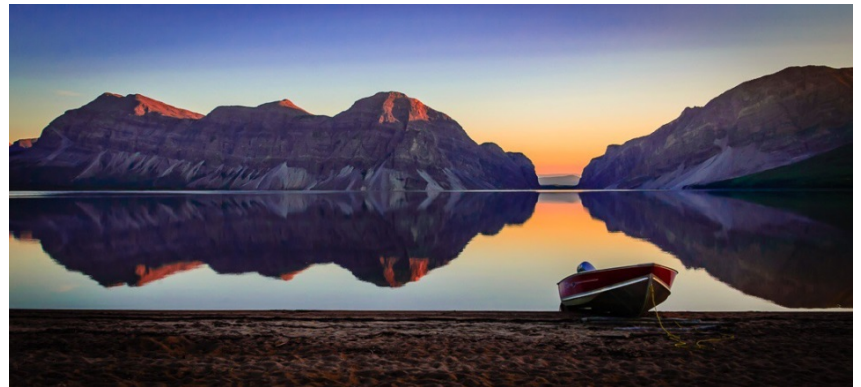
Abandoned on the beach at Little Doctor Lake, NWT