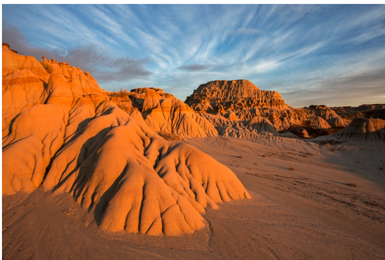
Dinosaur Provincial Park