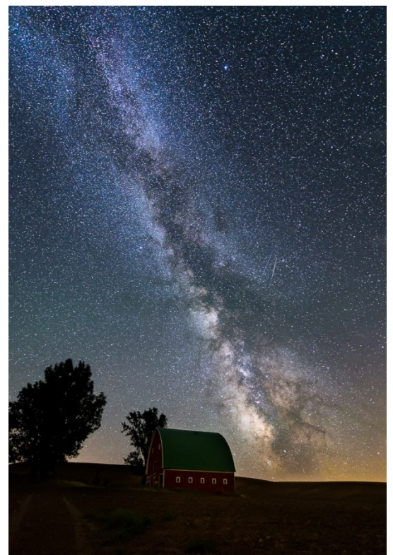
Milky Way over barn

Benefits vary for each corporate member, so always present your CCC membership card and ask about the club discount on your particular purchase.