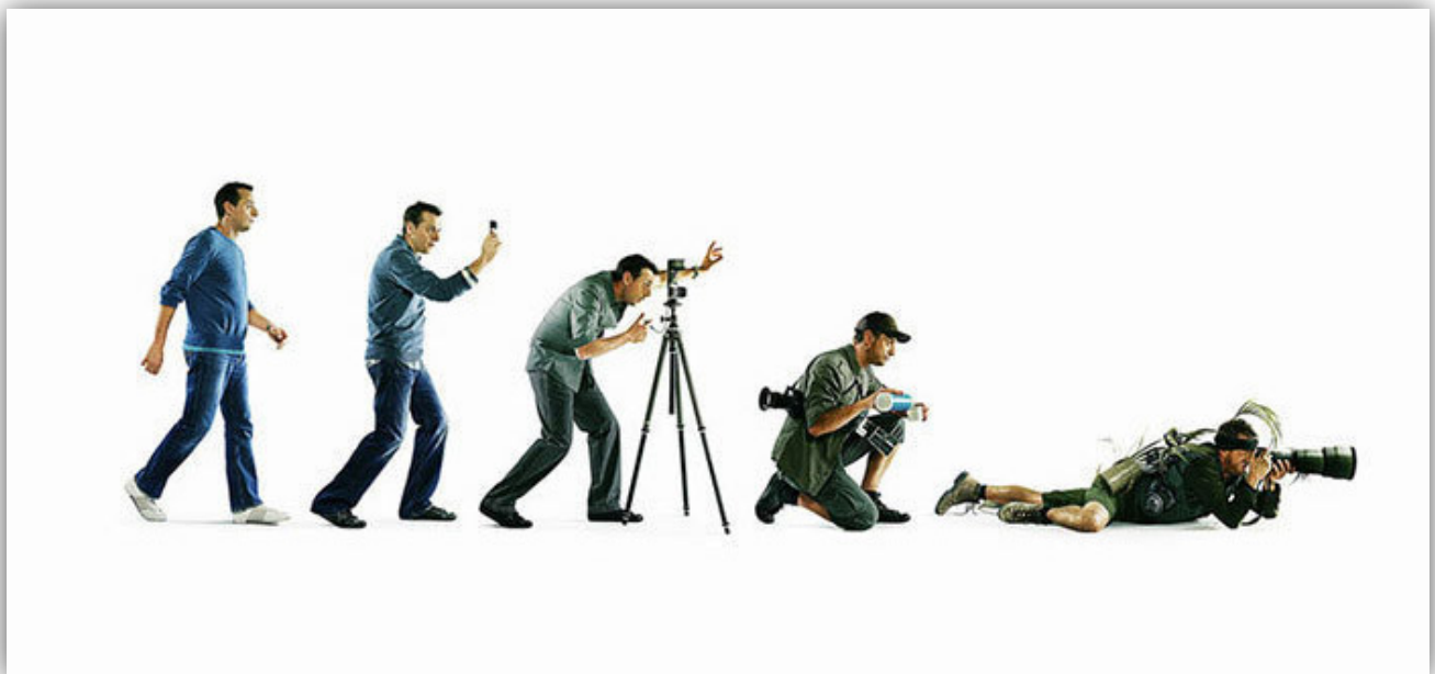
Evolution of the photographer