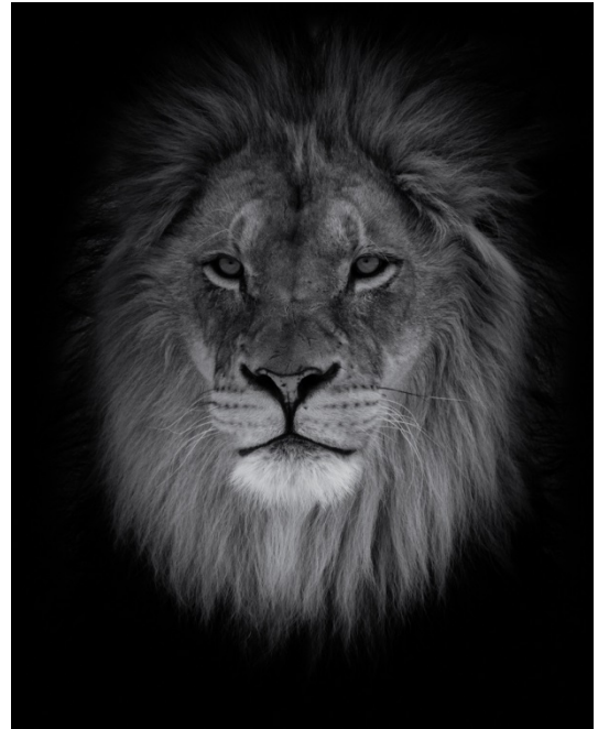
King of the Jungle