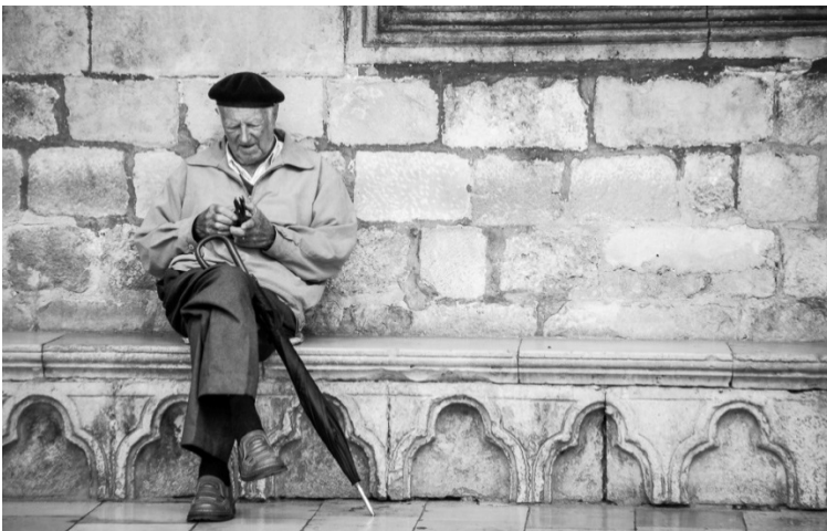
What time is it?