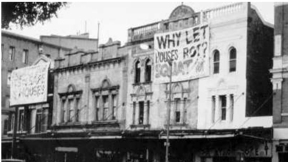
Squatted social centre Sydney

The Newcastle squat organisers cleared out an old locksmith shop and launched a dynamic art and event space in December 2000. The space played host to political film screenings, free dinners, durational performances, experimental sound nights, site-specific installations and acted as a hub for political & community activity. Squatted social centres spread throughout Newcastle. The larger Broadway Squat hosted numerous festivals and held mass community support - and even led to the creation of an 'UnRealestate' for other Squatters!