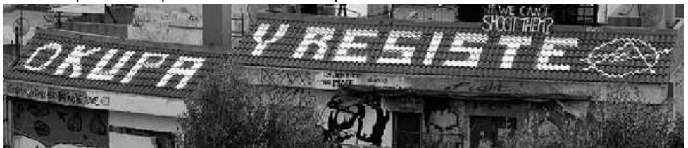
Occupy & Resist – Against landlordism for Self-managed housing

You should ask the police officer for reasons if he/she doesn’t explain why you are being moved-on. The direction must be reasonable . Parks and roads are NOT prescribed places. King George Square, New Farm Park and Kurilpa Point Park recently became “prescribed places” and move –on powers can be used in those areas.