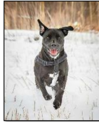
5 th Place: Pauline McIssac