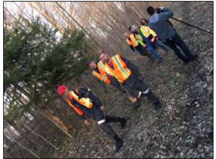
In this exercise, members search for evidence of a lost boy.

"Hullett absolutely is part of our training area given its size, topography and support from the association that maintains it. We at the Huron & Area Search and Rescue wish to thank the staff and volunteers of Hullett Provincial Wildlife Area for allowing us to use the area for our training. This co-operation will lead to further partnerships and training where members of our organization will hone their skills to be of better service to the community."