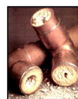
Professional Grade High Efficient Media