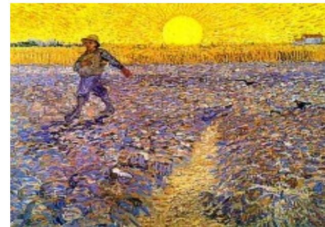
"A sower went out to sow; ... some seed fell on rich soil, and produced fruit, a hundred or sixty or thirty fold." (Gospel)