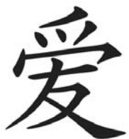
Chinese symbol for love

Here is where we journey together and know one another. Here is where we laugh and cry together. Here is where we celebrate and mourn together. Here is where we are known by the One who "created us and through whom we have our being." Here is where we are always welcome.