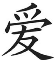
Chinese symbol for love

Here is where we journey together and know one another. Here is where we laugh and cry together. Here is where we celebrate and mourn together. Here is where we are known by the One who "created us and through whom we have our being." Here is where we are always welcome.