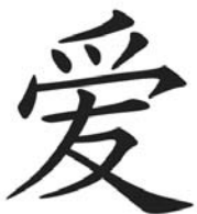
Chinese symbol for love

Here is where we journey together and know one another. Here is where we laugh and cry together. Here is where we celebrate and mourn together. Here is where we are known by the One who "created us and through whom we have our being." Here is where we are always welcome.