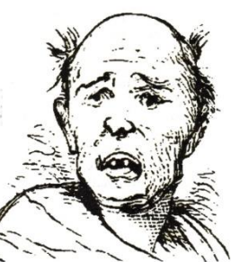
Before Shoal Creek