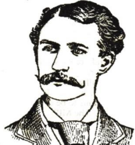
After Subscribing to the Shoal Creek Town Newspaper

I am most respectfully, your humble and obedient servant,