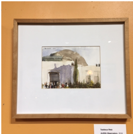
Taddeus Retz Griffith Observatory, 2016